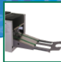
Optional automatic extending conveyor activated by the number of forms processed

Tel: 01493 664204 Fax: 01493 440241 E-mail: sales@gabforms.com Website: www.gabforms.com