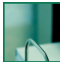
High capacity In-feed tray