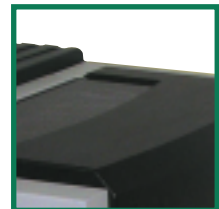
Optional automatic extending conveyor activated by the number of forms processed